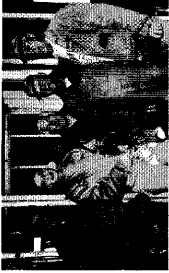
Some of our HP Honorary Crew

Thursday, October 1, 1998, we joined together at the Housing Partnership's 12 th Annual Meeting. The new slate of officers and the Board of Directors for 1998/99 were announced.