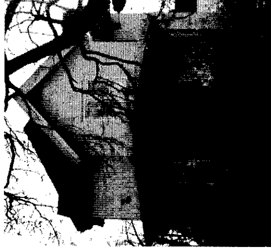
909 W. 4 th Street, Appleton

"I had a great time and I really feel I DID SOMETHING IMPORTANT"